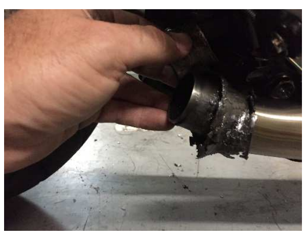
Unwrap broken gasket and remove.