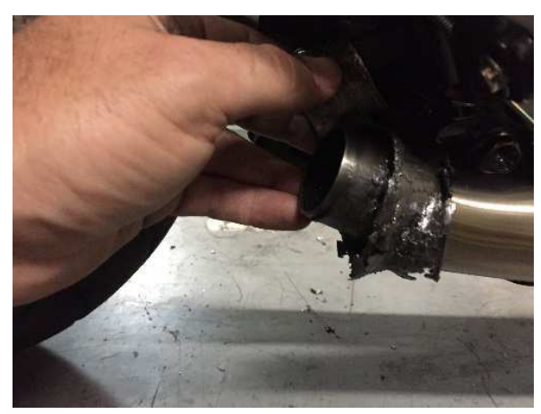
Unwrap broken gasket