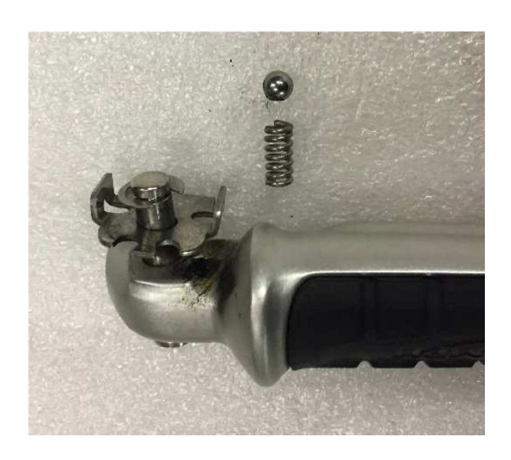
Passenger Foot Peg Assembly

Now you can access the allen head bolt that was behind the foot peg.